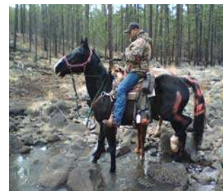
Rifle Bull Elk Hunt in 6A